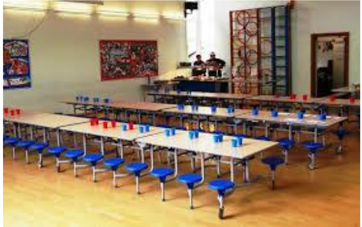
If we're not having lunch in our classrooms, this is where we eat lunch with our friends.