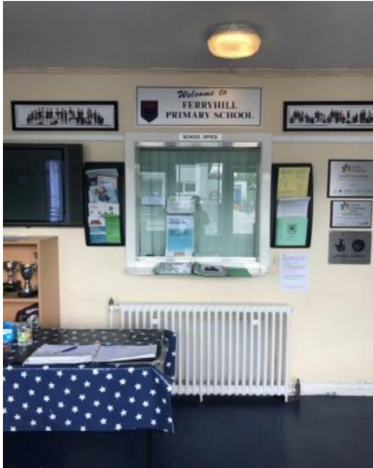
This is where you take the register