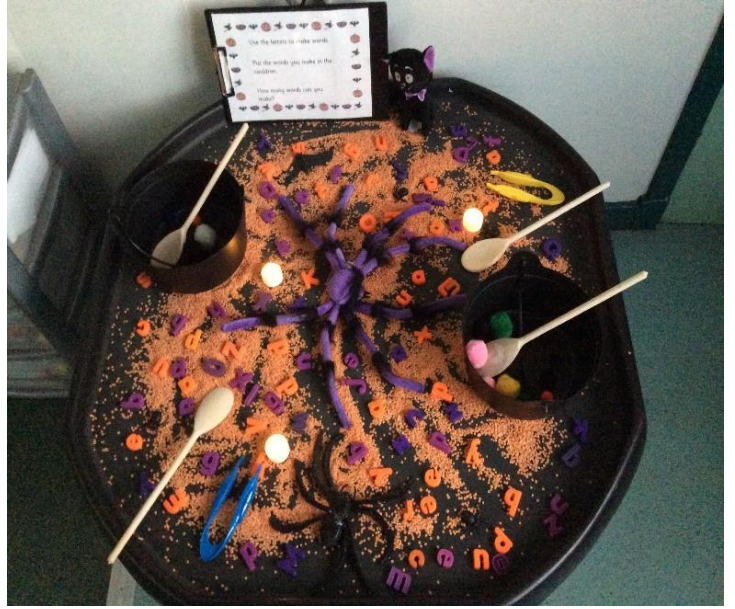
Spooky word building and rhyming