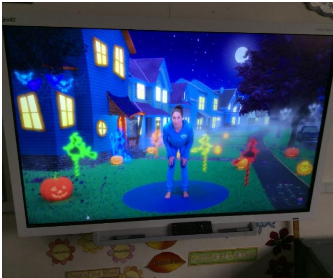
Spooky Cosmic Yoga