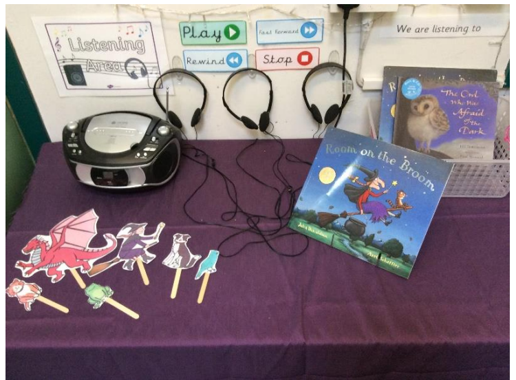
Spooky listening and talking